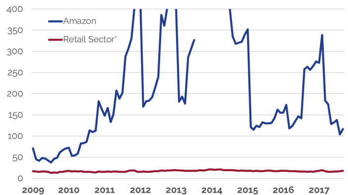
Figure 3: Amazon P/E vs. the Retail Sector

*P/E is based on consensus earnings estimates for current fiscal year and the retail sector is equal-weighted ex-Amazon earnings.