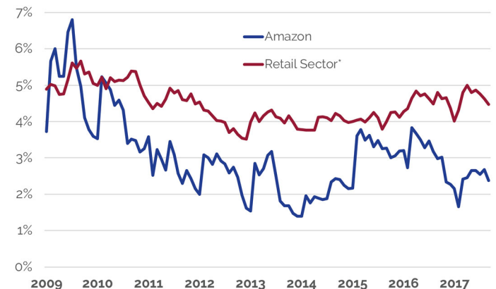
Figure 4: Amazon’s Distilled Cash Yield vs. the Retail Sector

*Retail sector is equal-weighted ex-Amazon.